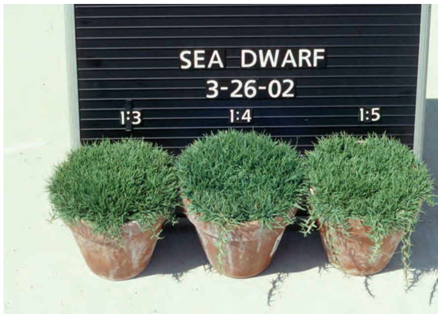
Figure 3. The number and corresponding length of stolons decreased in response to increasing the levels of irrigation water salinity. The 1:3 irrigation treatment had approximately 9,400 ppm TDS (14.0 deciSiemens/meter), and the 1:4 and 1:5 treatments had approximately 7,400 ppm TDS (11.0 deciSiemens/meter) and 6,400 ppm TDS (9.6 deciSiemens/meter), respectively.

One interpretation of these data is that