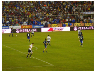
Lionel Messi, (No. 10) plays on SeaDwarf®