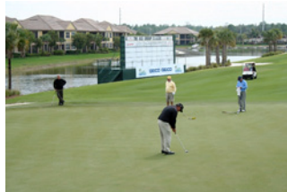
The Pros putt on SeaDwarf® at The Quarry

The event is well-known for annually attracting the strongest field of competitors from the Champions Tour Official Money List. The 2010 ACE Group Classic, also held at The Quarry, was especially memorable as Fred Couples captured his first title on the Champions Tour after defeating Tommy Armour III by one stroke. The victory was Couples’ first official event victory since the 2003 Shell Houston Open on the PGA TOUR.