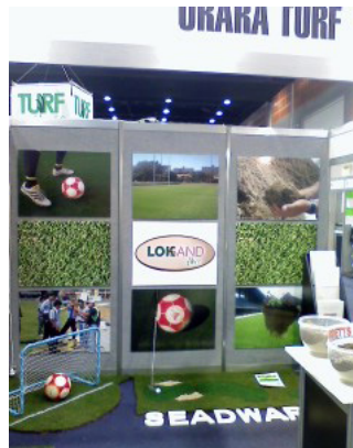
Orara Turf highlighted SeaDwarf in their booth recently at the Australian Golf Course Superintendent’s Association meeting

To learn more about Jardines Urbanos Click Here