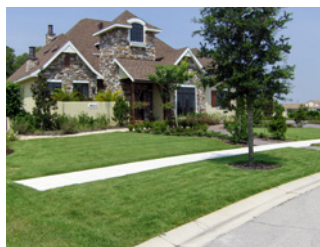
A home lawn grassed with UltimateFlora® Zoysia