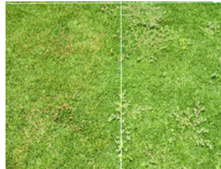
Plot on the left was treated. Plot on the right was an untreated control. Note the difference in spotted spurge population.

The second experiment was done to compare the response of SeaDwarf® and TifDwarf maintained at putting green height to table salt applied at 30 pounds per 1,000 square feet. Location of this study was Winter Pines Country Club in Winter Park, FL. SeaDwarf® was injured by table salt but quickly recovered (see Figure 1). TifDwarf was more severely injured and recovered more slowly. Salt damage was assessed by visually estimating turf quality and using the Normalized Vegetative Difference Index (NVDI). The NVDI is an objective measurement of turfgrass quality that measures light reflected from the turf at specific wavelengths. Data suggested SeaDwarf® is more tolerant to table salt than TifDwarf at putting green height. It also suggested table salt may be better suited as a herbicide for paspalum, and 30 pounds salt per 1,000 square feet may be too high a rate for greens. Additional research is being conducted looking at lower rates of application on greens.