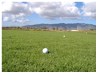
SeaDwarf field in Hawaii