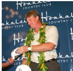
Ernie Els at Hoakalei

"This is a fine-textured, warm-season turfgrass particularly suited for use from tee to green on golf courses and sports fields," Els was quoted as saying. "It has a tighter knit and delivers faster green speeds than other varieties of this type of grass... This is a win-win solution because it can save time and money and contribute to a cleaner environment by putting fewer chemicals into the ecosystem."