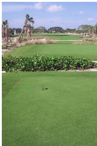
SeaDwarf® tee box