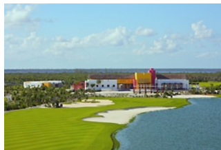
Playa Mujeres in Mexico