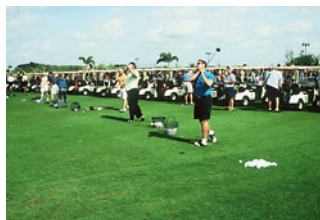
Golfers warm up for tournament