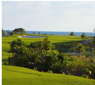
SeaDwarf at Playa Mujeres