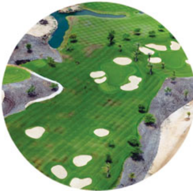
The new Hoakalei golf course.

The Hoakalei Country Club opens Jan. 12 and 13 with the inaugural Els Hoakalei Cup charity golf tournament. The club features a golf course designed by professional golfer Ernie Els and will include a clubhouse, hotel, resort spa, resort residences and marina.