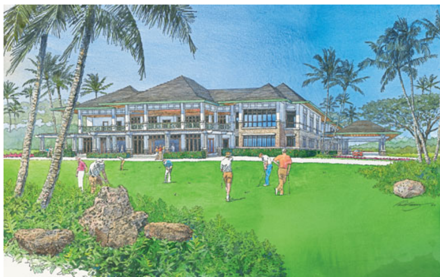
Artist's rendering of the coming Hoakalei Country Club clubhouse.