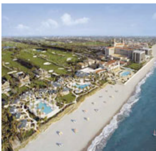
Thanks to The Breakers' seaside location, wind can be a challenge in maintaining the turfgrass and plants. Using the right irrigation system components and keeping plants healthy helps the landscaping stand up to the desiccation.

When guests check in for a stay at The Breakers Palm Beach, a luxury resort in Florida, they expect relaxation, but they also demand perfection. That means that not only do the amenities and rooms meet the highest standards, so do the grounds.