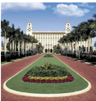
The main drive entering The Breakers Palm Beach sets the stage for guests with an impressive landscape of turf, trees, flowers and tropical plants.

Resort sets the standard for luxury landscaping