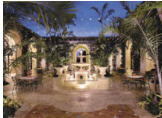
The grounds staff cares for all interior and exterior plants. With hundreds of palm trees on the property, pruning and leaf collection is a regular part of the job.

Guests are continually strolling throughout the grounds, taking in all of the lush landscape, he points out. The area around the front lawn features benches where guests can sit amidst the plantings. There's also an organic vegetable and herb garden, where chefs from The Breakers harvest ingredients for the restaurants. "It's very interactive, there's nearly always a guest in there sampling something or watching or looking at the names of the plants," says Singleton.